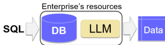
Figure 2: With the increasing number of enterprise LLMs trained with proprietary data, hybrid SQL querying enables to extract structured data from heterogeneous sources. The DB models the relational data, while the LLM exposes the data from unstructured sources. This paradigm can query data in text without human preprocessing.

text, and PDF files. Querying their representation in a LLM enables the retrieval of information that is out of reach by accessing only the DB, as depicted in Figure 2. We envision the ability to query data beyond what is already modeled in a structured schema, for example by designing a polystore system on heterogeneous storage engines [2, 16]. An example of jointly querying with one user-provided script a DB and a LLM is the following