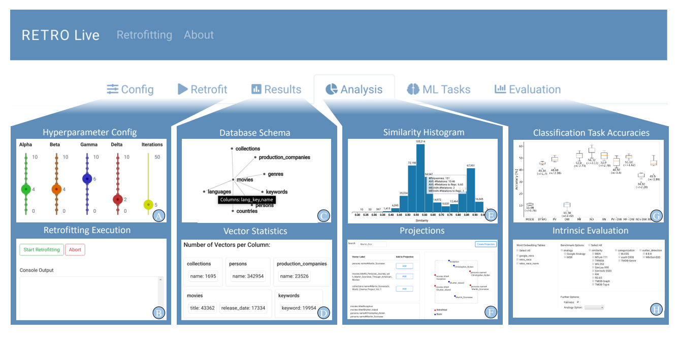
Figure 3: Demo User Interface

involved or in how many different columns a term appeared or to get a complete list of embeddings in the selected bin. Moreover, a 2-dimensional projection (PCA) shows the user-selected plain text and retrofitted vectors (()). In context of the TMDB database example, it can be seen that the vectors for movies and directors are arbitrarily distributed in the word embedding (red). However, after applying relational retrofitting the movie and director vectors (blue) are clustered and the difference vectors between movie and director pairs are of same length and orientation.