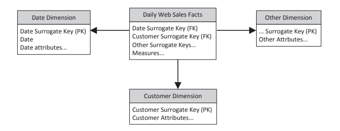
Figure 1: Standard TPC-DS schema.

While the use of the surrogate key helps reduce the size of the fact table, it does introduce costs at query time. Queries will often have predicates involving (natural) date values to access data from the fact table. This necessitates a potentially expensive join between the fact and date tables.