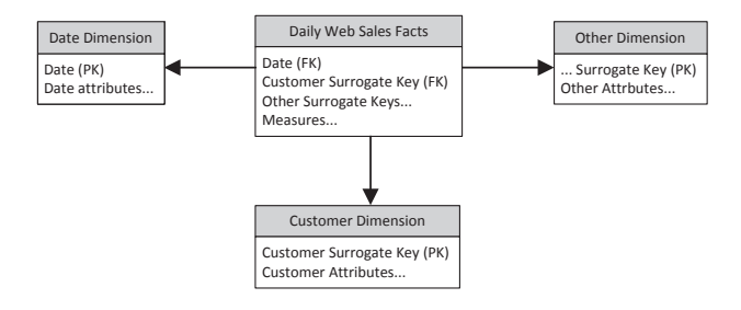
Figure 2: Alternative TPC-DS schema with natural date key.

IBM recommends to its business customers to use a natural key for the date table (using the date data type). IBM DB2 manages to store the date data type in a compact four bytes. The advantages of using a surrogate key in this case are nullified. For this reason, we consider also a variation of the TPC-DS schema as in Figure 2 which uses the natural date key in the date table and in the fact table for the foreign key.