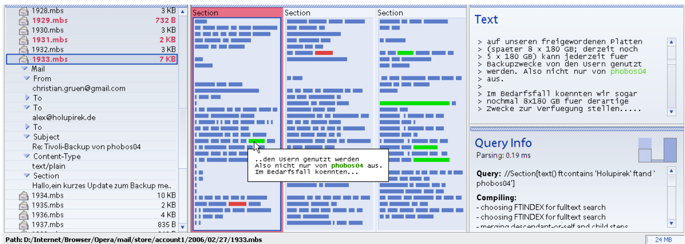
Figure 3: BaseX provides visual access to query results. The user can browse and manipulate the results and further refine the result set by issuing further keyword-based or full-fledged (X)Queries.

(including a logging trace of the table accesses). We prepare numerous example queries (using BaseX as command line interpreter), so you do not have to rely on your XPath/XQuery knowledge. What you should experience from the demonstration is the parallel use of known, established and conventional filesystem interaction together with the query capabilities of an XQuery Processor. Recalling Figure 1, the two views on the filesystem/database instance are offered to the user and ready to be explored.